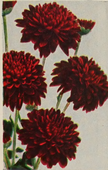
HERO. 60c each; 3 for $1.50